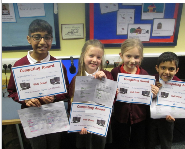
Infant winning entries